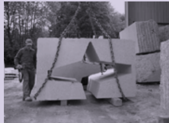
IN ORDER TO MINIMIZE MACHINE TIME FOR THE SEVEN-AXIS STONE CUTTER AND ROUTER AT GRANITS BARBANY, A BLANK IS PREPARED CUT BY A DIAMOND WIRE AS CLOSE TO THE FINAL SIZE OF THE PIECE BEING PREPARED, IN THIS CASE, THE BASE FOR ONE OF THE NARTHEX COLUMNS.