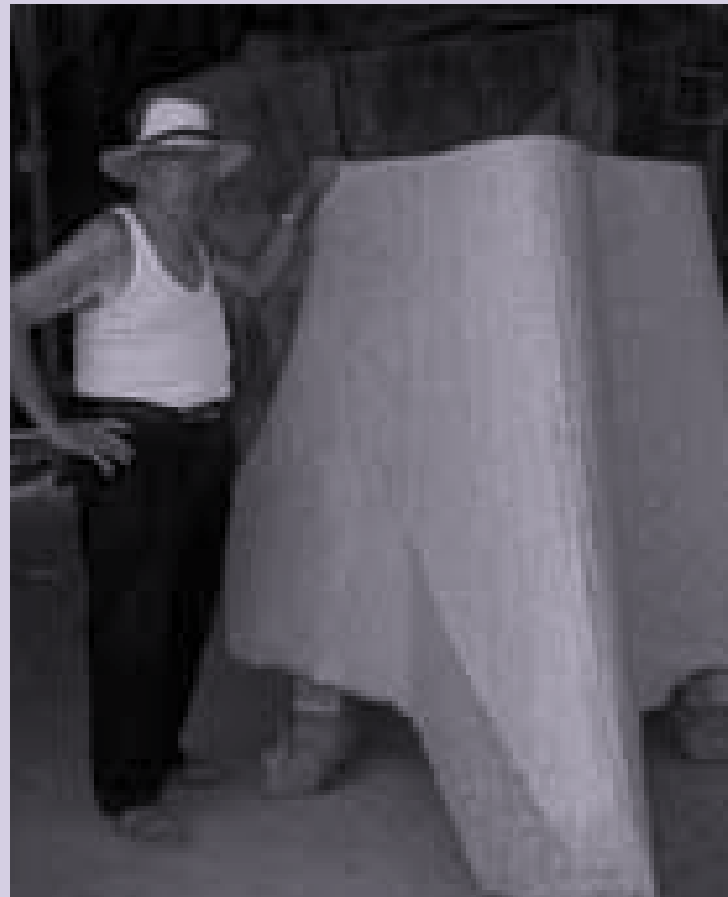
PREPARATION OF THE COLUMN BASE FOR ONE OF THE NARTHEX COLUMNS, A FULL-SCALE PROTOTYPE HERE MADE FROM GRANITE PRIOR TO BEING HAND-FINISHED. A VARIETY OF SURFACE TREATMENTS ARE TESTED AS PART OF THE DESIGN PROCESS.