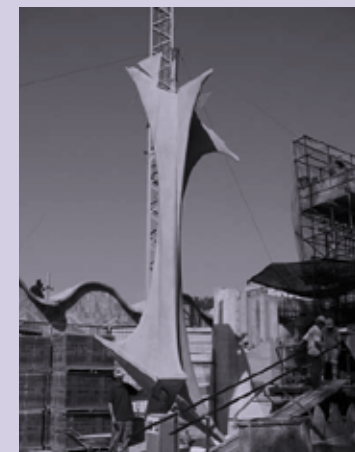
DEVELOPMENT OF THE COLONNADE DESIGN ABOVE THE NARTHEX (PASSION FAÇADE). THE COLUMNS HERE ARE PAINTED POLYSTYRENE PROTOTYPES MACHINED DIRECTLY FROM A 3D DIGITAL MODEL.