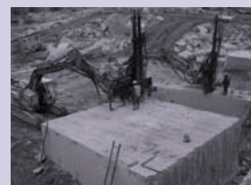
EXTRACTING STONE FROM THE TARN QUARRY (FRANCE) 'CUT TO ORDER' RATHER THAN CRUDELY BLASTED FROM THE ROCK FACE. THE PARAMETRIC MODEL OF THE NARTHEX COLONNADE GENERATES 3D MODELS FOR THE GRANITE BLOCKS IN ORDER TO MINIMIZE WASTE.