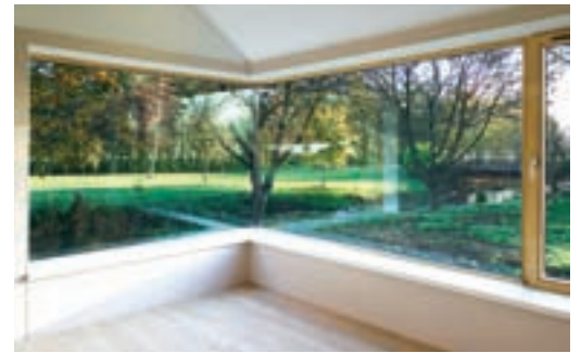
In the dining area, which floods with light in the afternoon, a cantilevered corner window measuring four by eight metres frames views onto the river.