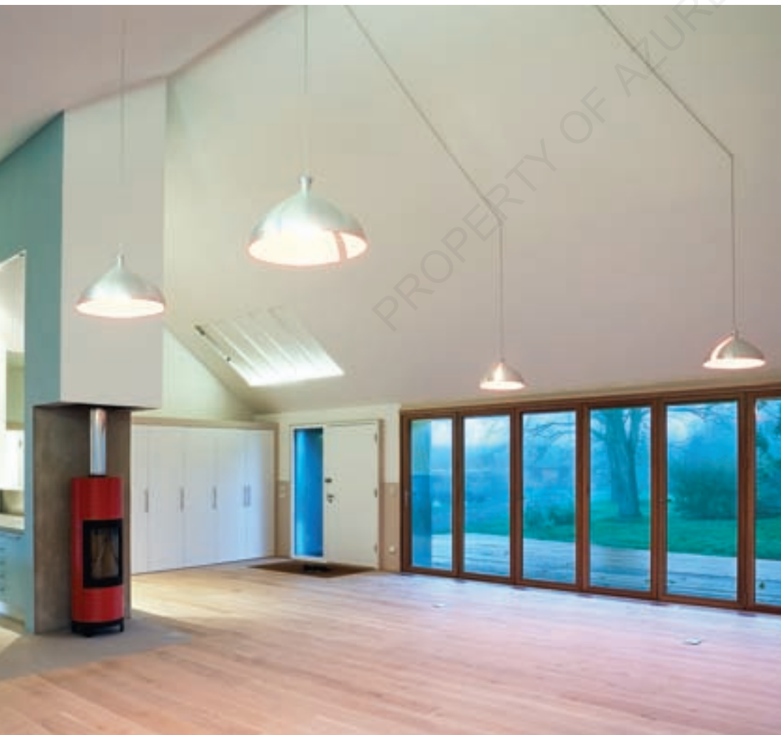
Top: An eight-metre line of sliding glazed doors, which fold in completely, extends the living room onto a deck on the west side of the house, overlooking the future site of an orchard.