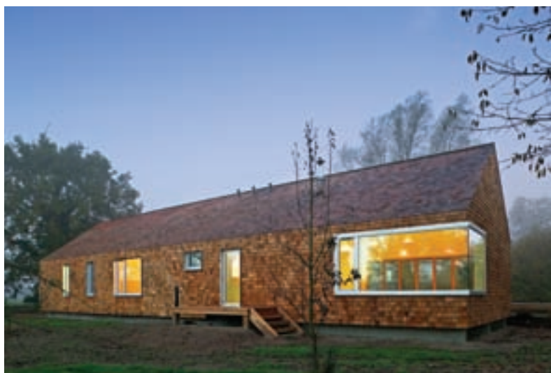
The house is clad in 15,000 untreated cedar shingles, a material that belies the prefabricated system beneath. Fixed to battens over a breathable waste wood chip building board, cedar was chosen as a cost-effective alternative to weatherboard.